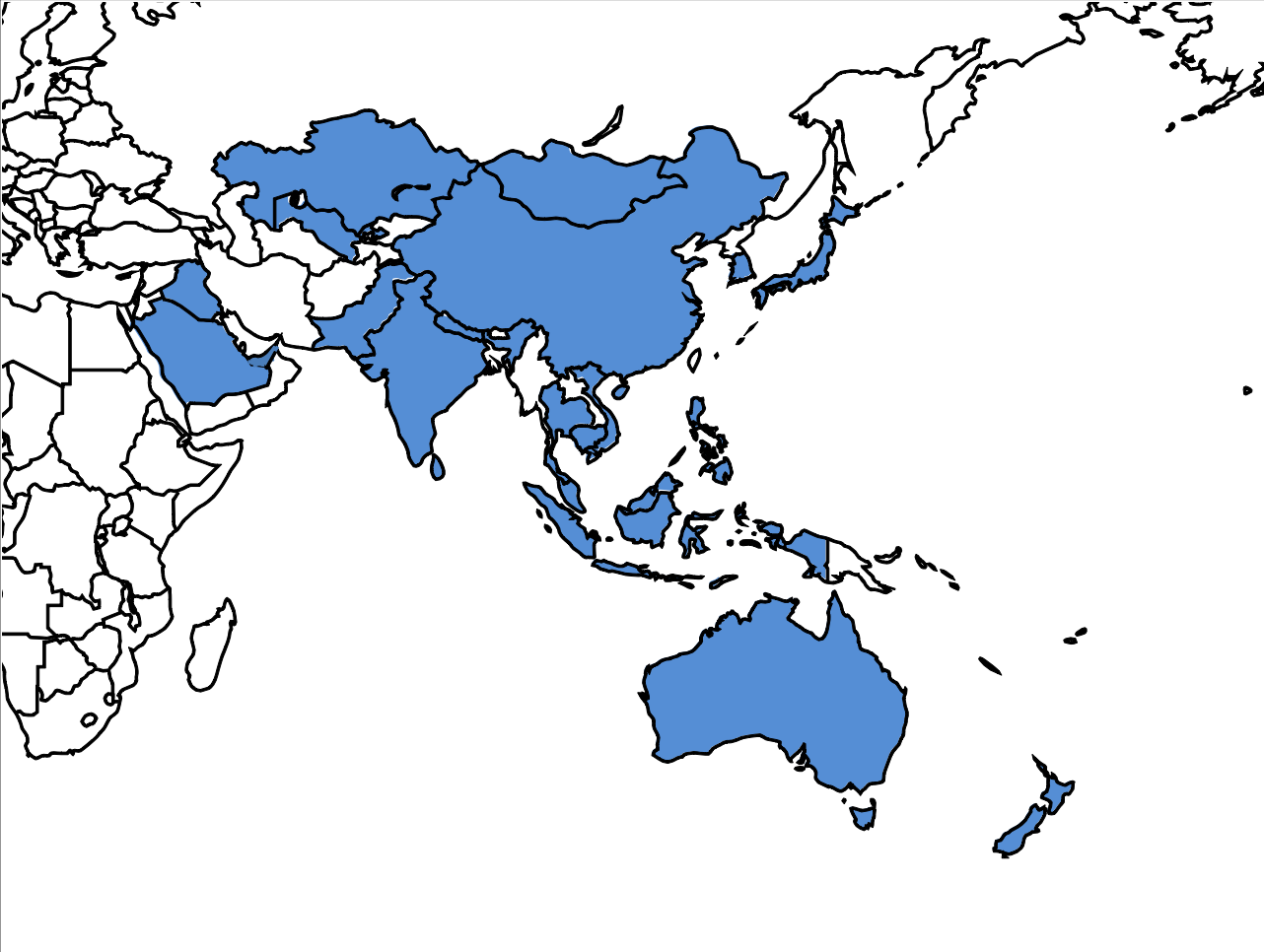
Map 1: Jurisdictions of AOSSG members

Jurisdictions of the AOSSG members cover a large part of the Asia-Oceania region and are highlighted in blue in the map below.